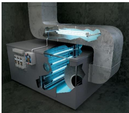
AHU / RTU & Airstream Disinfection