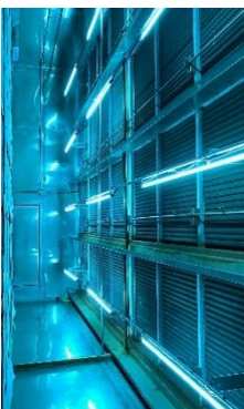
Air Handler Disinfection

For more information on Fresh-Aire UV systems or to discuss your specific application, please contact 1-800-741-1195 or email sales@FreshAirUV.com .